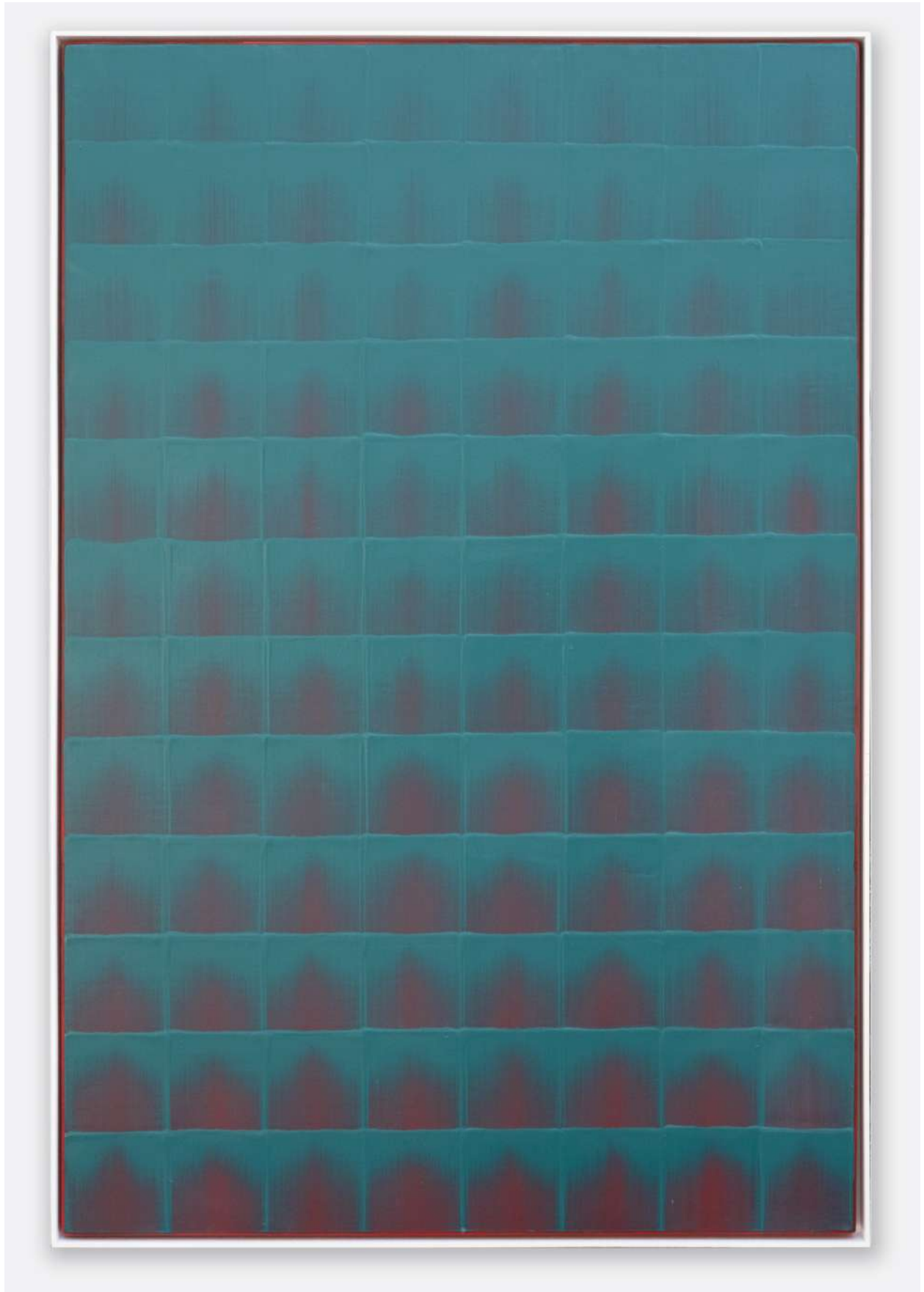
Peng Yong, 3000 realms in a single moment of life n°5-2022 , 2022, acrylic on canvas, 122 x 82 cm