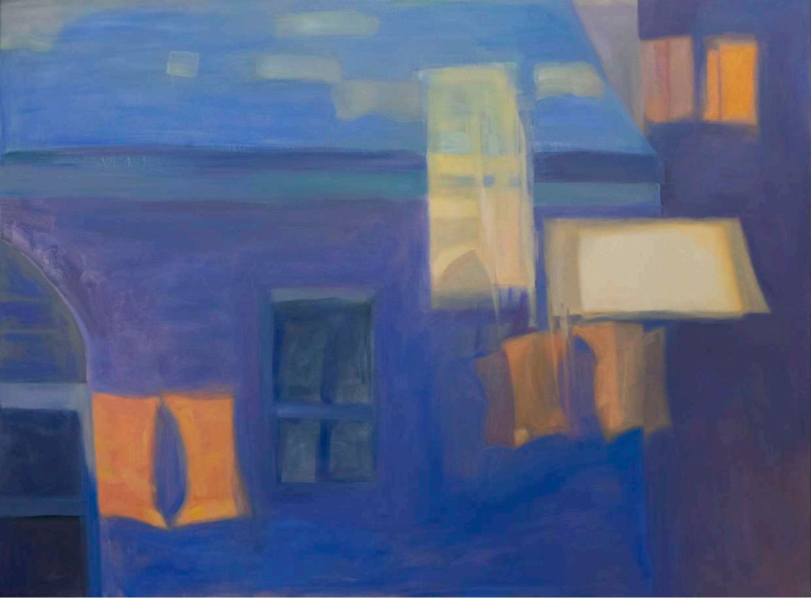
Yang Yi, La Chasse , 2020, oil on canvas, 97 x 130 cm