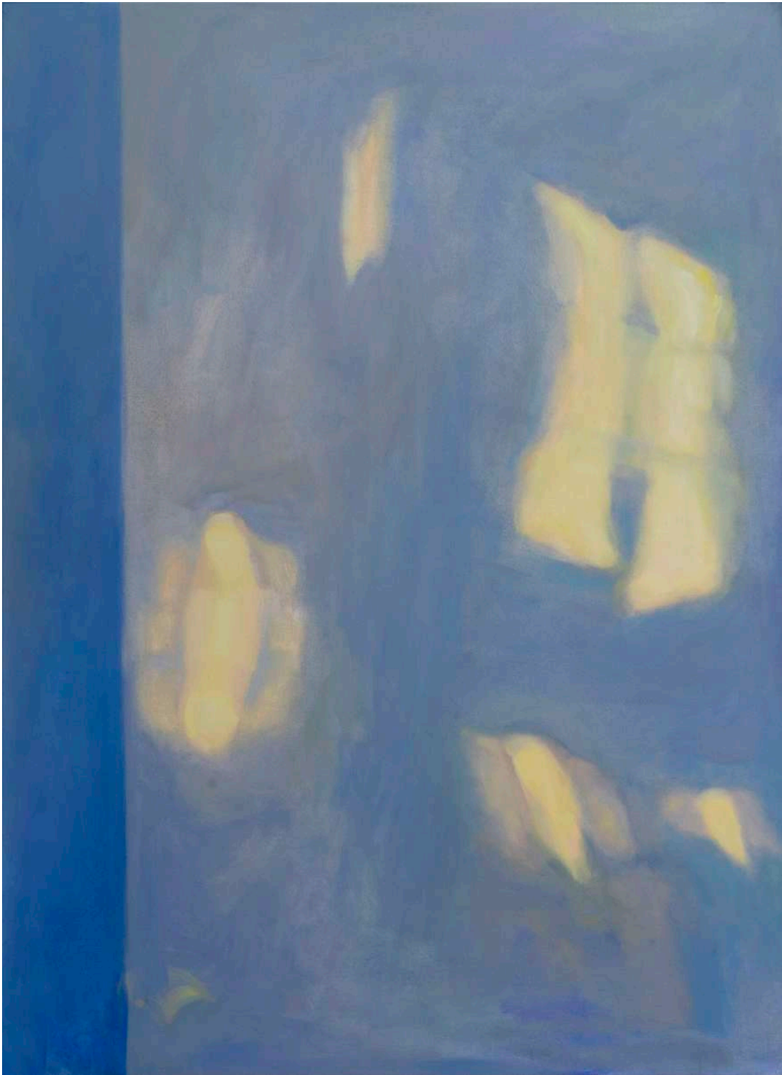
Yang Yi, La Chasse , 2020, oil on canvas, 100 x 73 cm