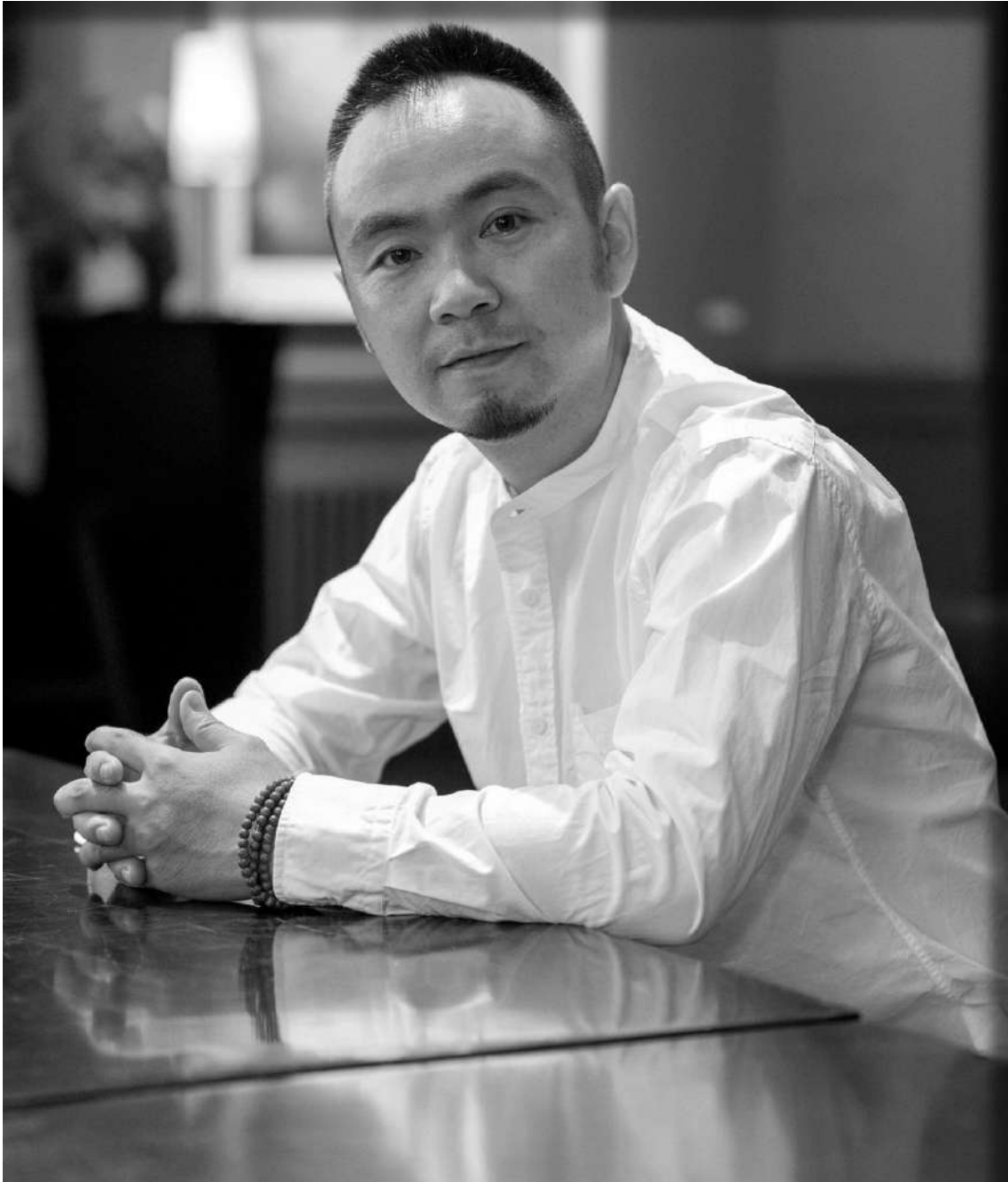
Portrait of Peng Yong