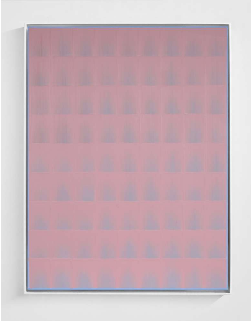
Peng Yong, 3000 realms in a single moment of life n°98 , 2022, acrylic on aluminium composite panel, 60 x 45 cm